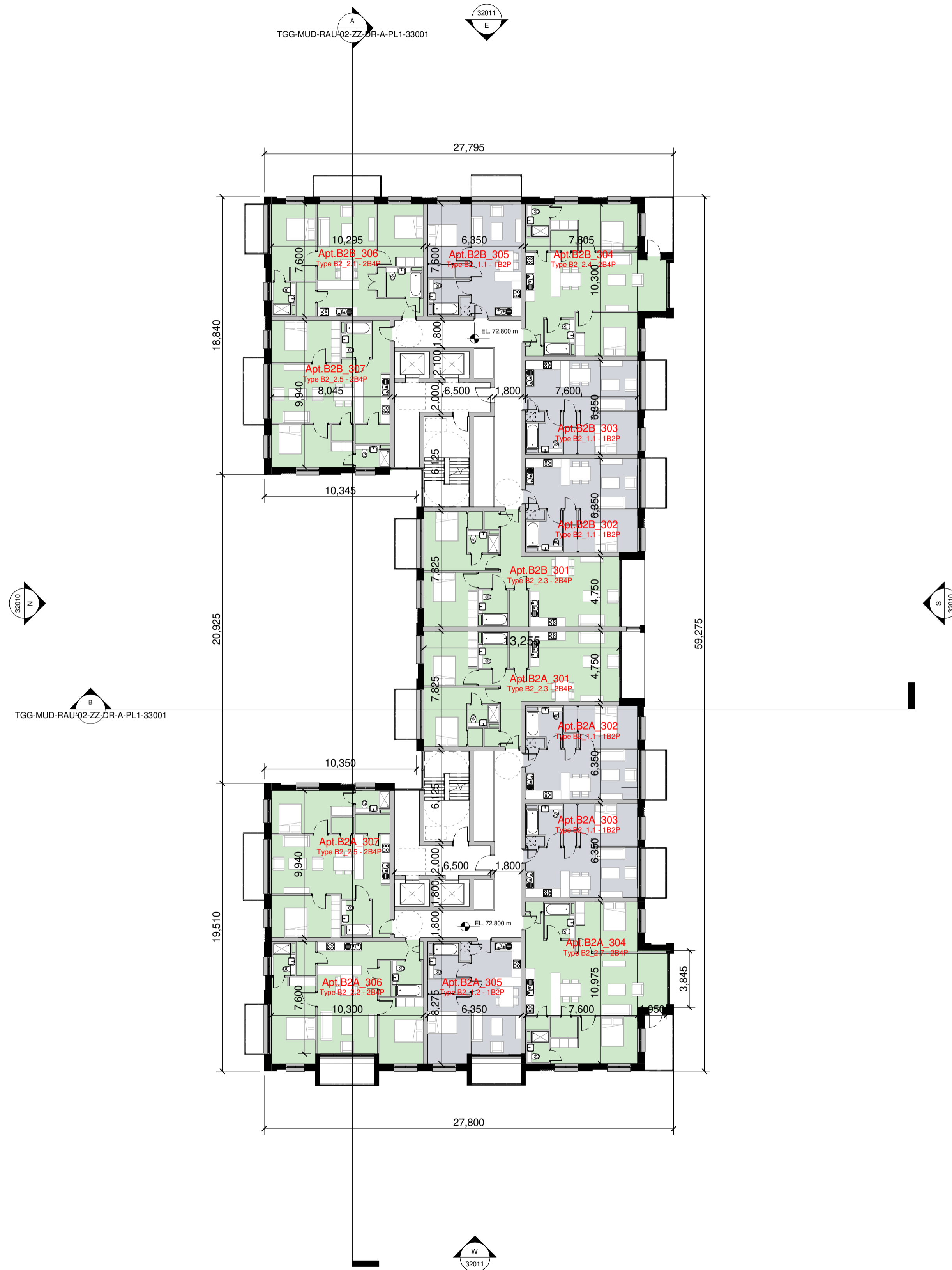
3 Proposed Building 02 - L03 - Third Floor Plan 1 : 200