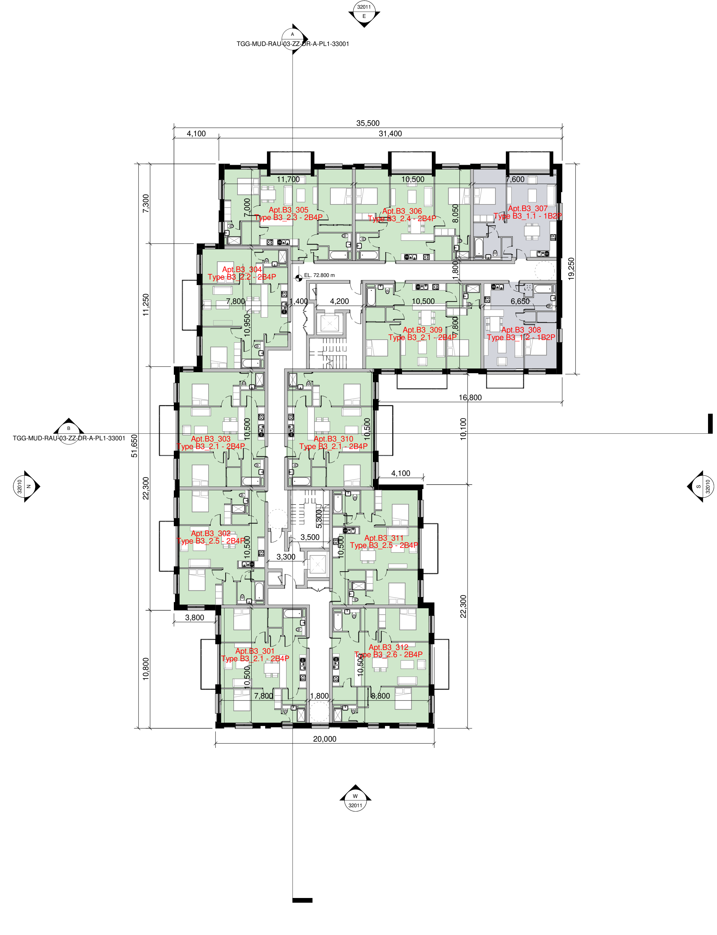
3 Proposed Building 03 - L03 - Third Floor Plan 1 : 200

Notes: - Do not scale from this drawing. Use figured dimensions in all cases. - Verify dimensions on site and report any discrepancies to the Architect immediately. - This drawing is to be read in conjunction with the Architect's Specification. - © This drawing is copyright and may only be reproduced with the Architect's permission.