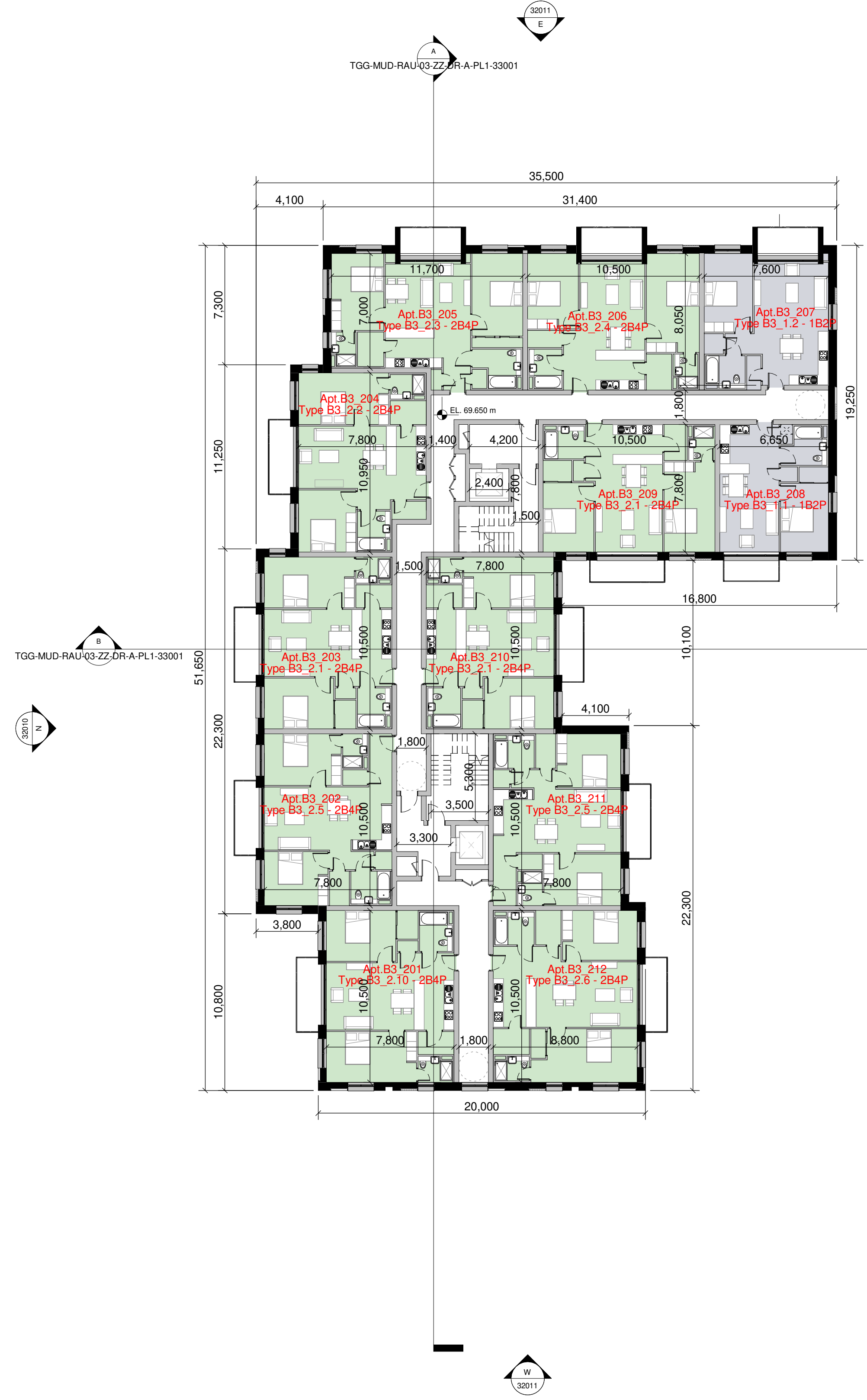
2 Proposed Building 03 - L02 - Second Floor Plan 1 : 200