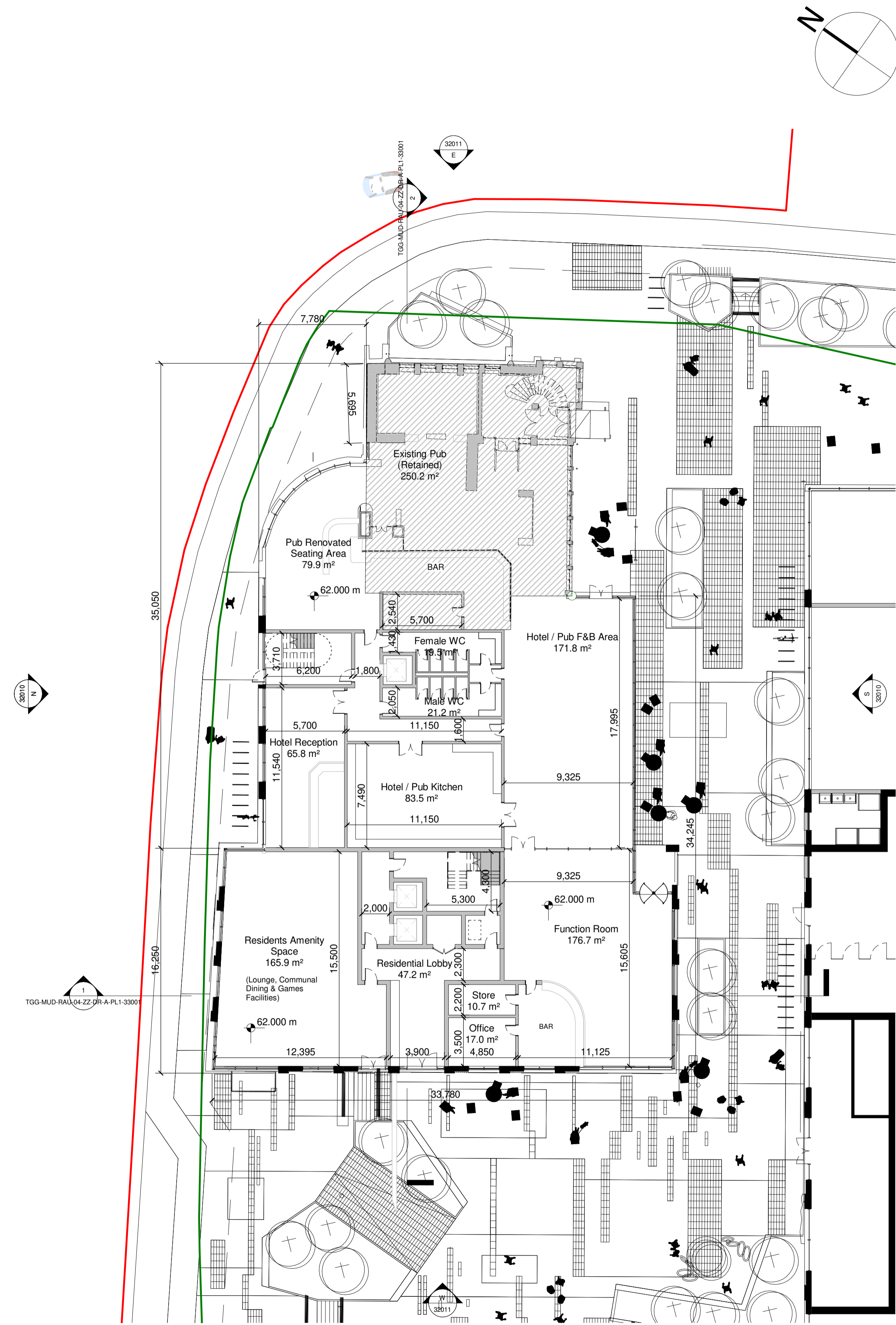
G Proposed Building 04 - L00 - Ground Floor Plan 1 : 200