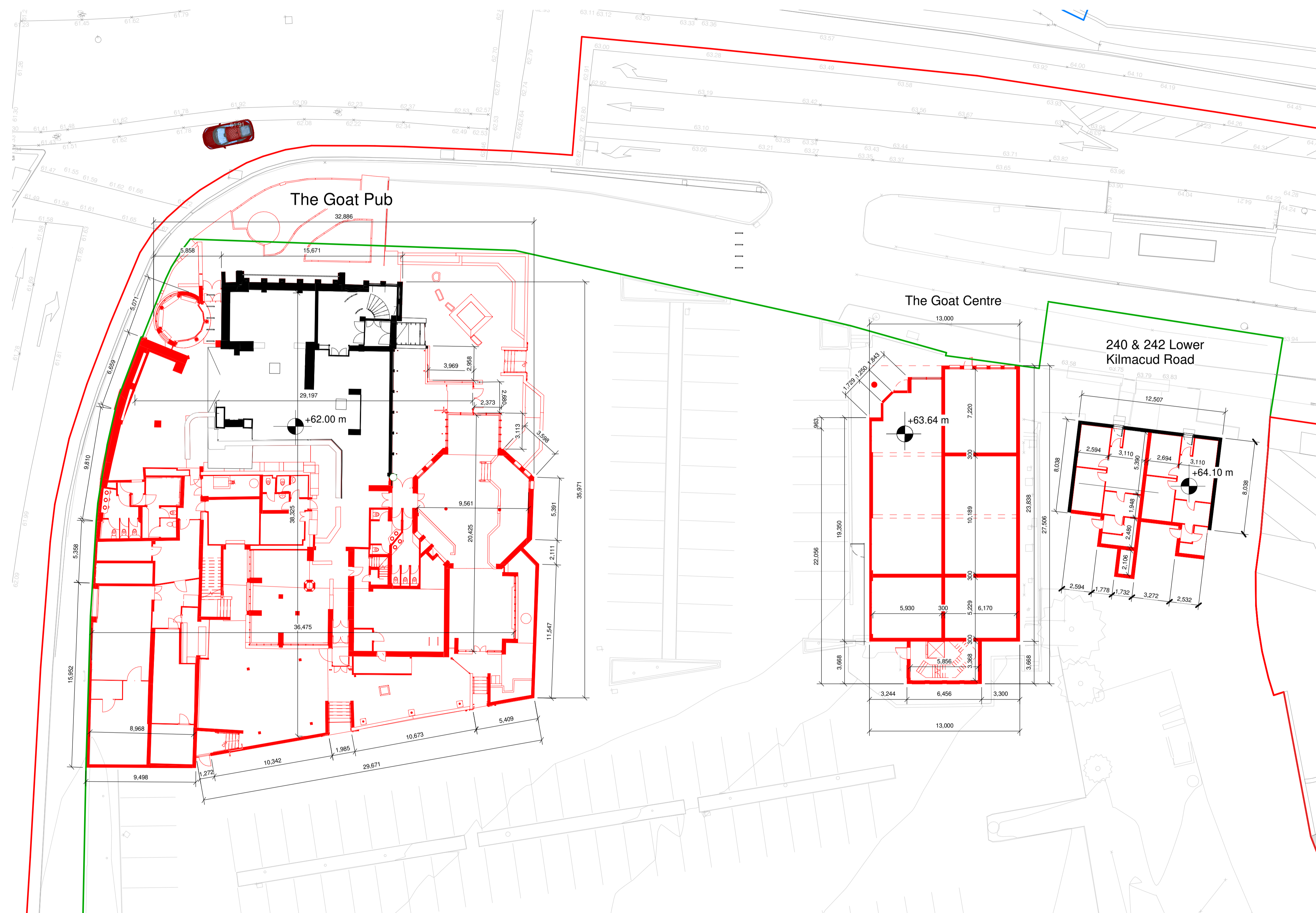
G Demolition Plan - Ground Floor 1 : 200

Notes: - Do not scale from this drawing. Use figured dimensions in all cases. - Verify dimensions on site and report any discrepancies to the Architect immediately. - This drawing is to be read in conjunction with the Architect's Specification. - © This drawing is copyright and may only be reproduced with the Architect's permission.