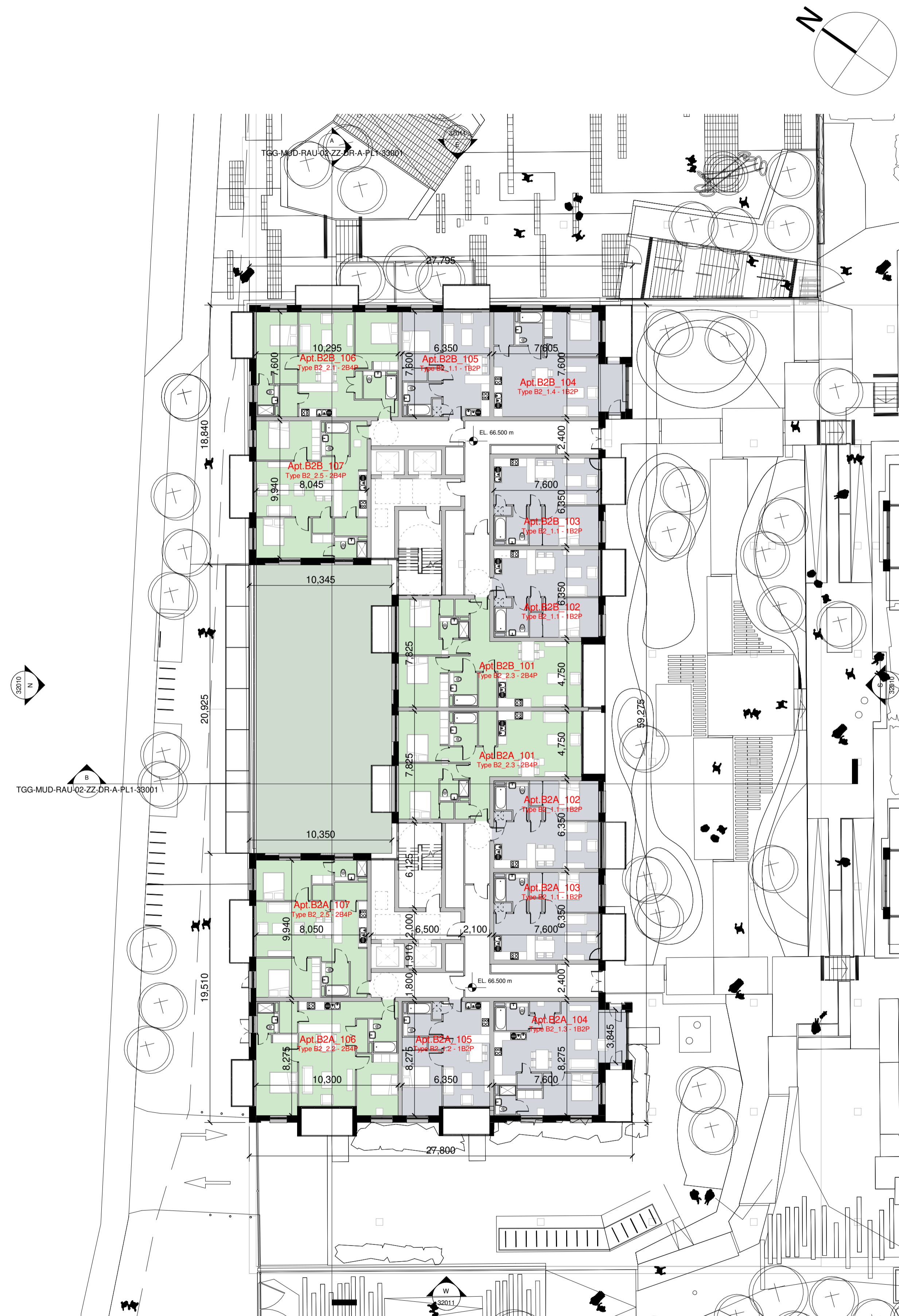
1 Proposed Building 02 - L01 - First Floor Plan 1 : 200